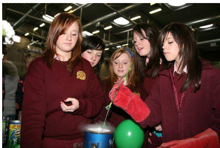
SciFest IT Sligo Students investigating the properties of dry ice

In total 1,980 students from 162 schools exhibited 836 projects nationwide in SciFest